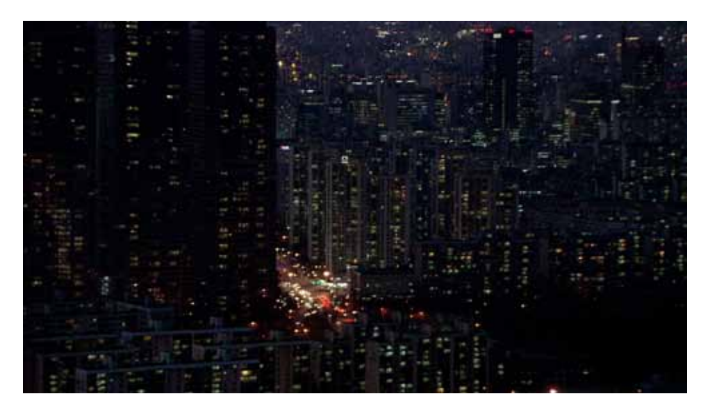
PHONE TAPPING Video HD 3D compositing, 10'20, colour, stereo sound, 2009