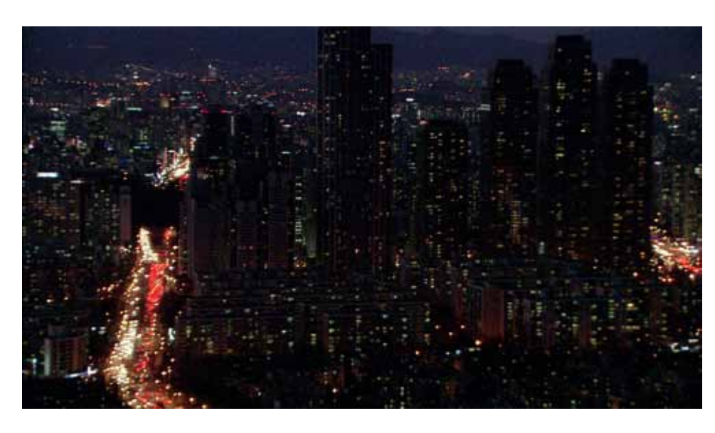
PHONE TAPPING production of The Fresnoy, National Studio of Contemporary Arts